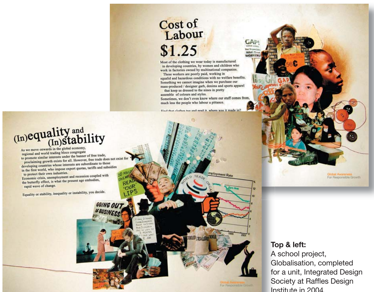
Top & left: A school project, Globalisation, completed for a unit, Integrated Design Society at Raffles Design Institute in 2004.